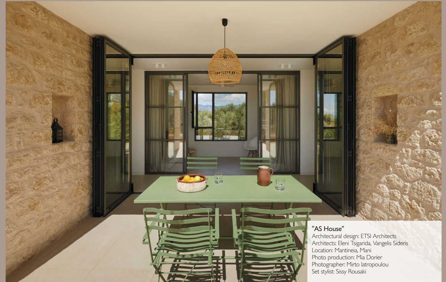
"AS House" Architectural design: ETSI Architects Architects: Eleni Tsigarida, Vangelis Sideris Location: Mantinea, Mani Set stylist: Sissy Rousaki

The house emerges quietly from the olive groves of Mantinea, its form rooted in the land and oriented toward the Gulf of Messinia. Bamboo, light wood, and soft lime surfaces meet under a pitched roof. The kitchen reflects the simplicity of Greek rural life, reimagined with precision. A shaded outdoor room blurs the boundary between inside and out—the house extends toward the grove, embracing the rhythm of Greek summer life.